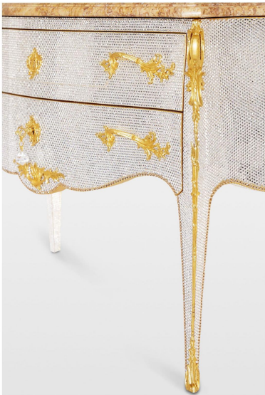
22-carat gold leaf applications