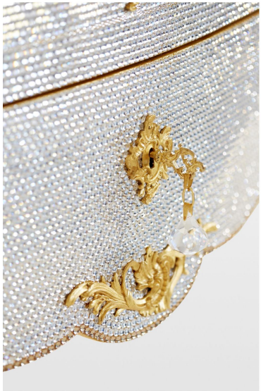
35,000 hand-applied Swarovski Crystals