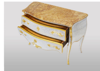
w 1130 x d 470 x h 820 mm