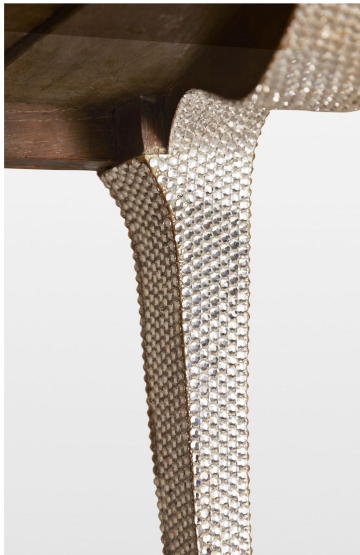
Hand-crafted from solid Walnut Wood

QUEEN GLAMOUR I. is entirely made in France. Its body is carved from quality matured Walnut Wood, embellished with its well-preserved original decorative elements, and topped with its stunning Breche d'Alep marble cover plate.